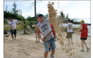
Moving Sand in Eleuthera; compliments of the hurricane